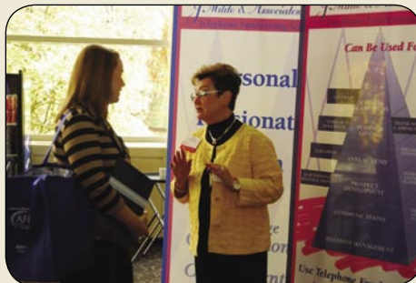
NPD 2008 attendee with vendor