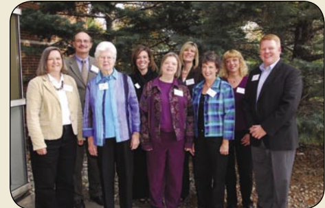
NPD 2008 Honor Roll of Philanthropy honoree Bethany Christian Services Kalamazoo Women's Guild and guests