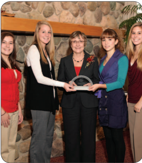
Youth in Philanthropy—Bernadine Mott Chapter of the National Honor Society, Comstock, MI