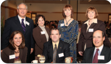
Porter Hills Retirement Community & Services Honoring "The Anonymous Donor"