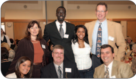
Western Michigan University Honoring The American Federation of State, County & Municipal Employees (AFSCME) in support of the Seita Scholars Program